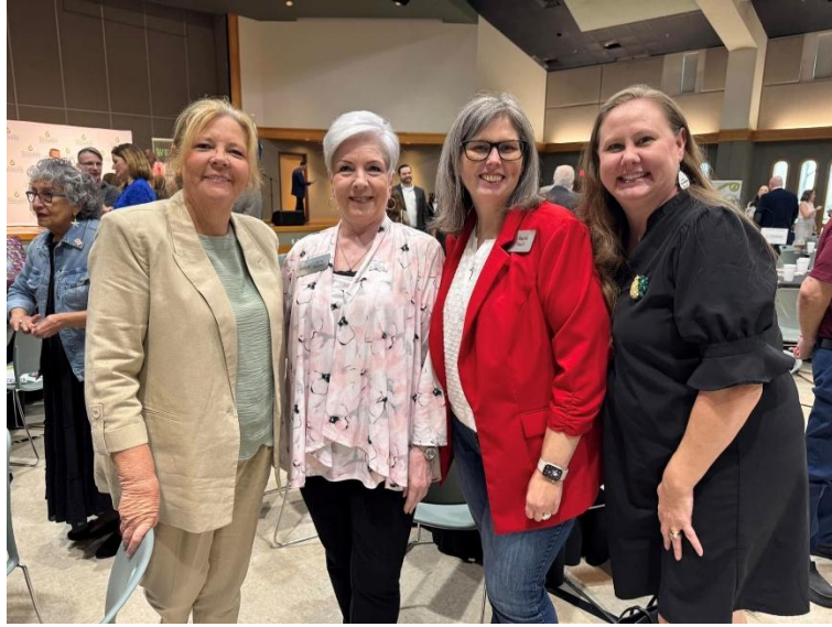
2025 State of Pearland ISD Luncheon