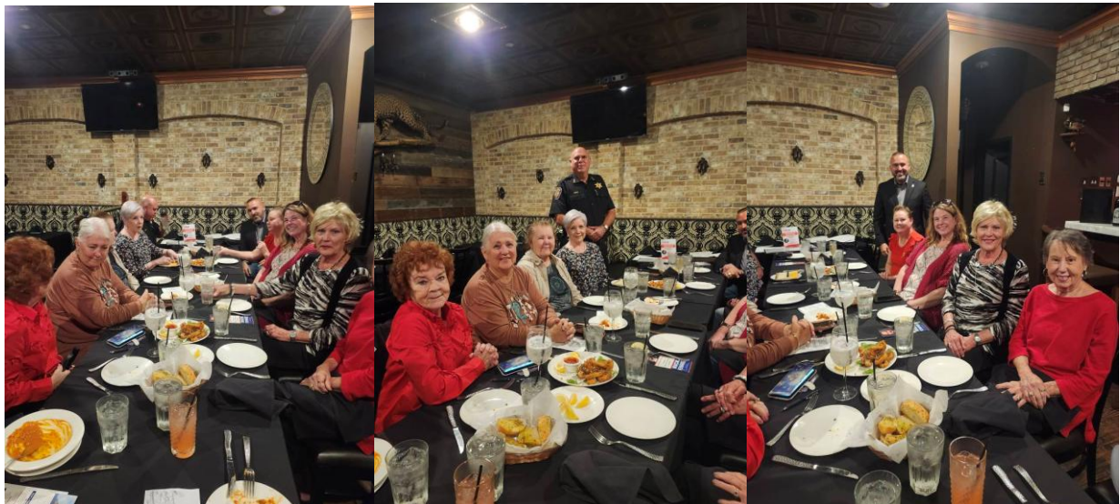
Ladies that Lunch