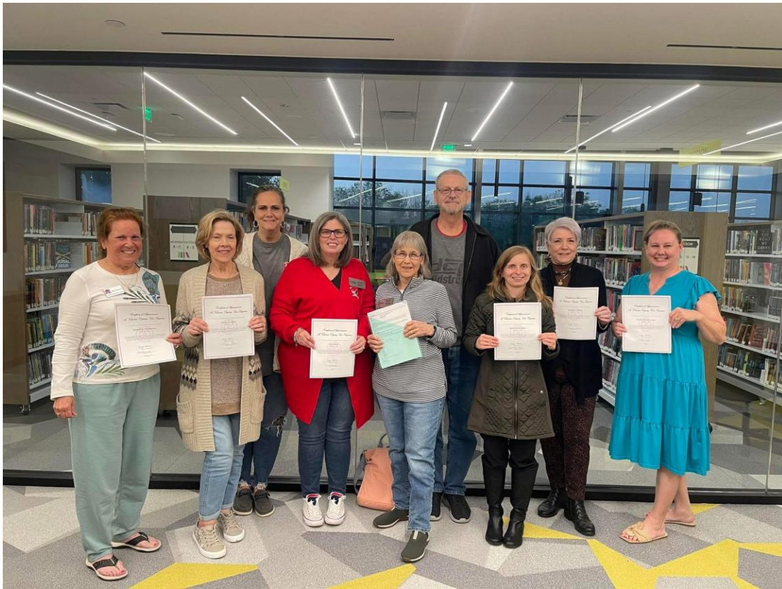
VDR Training – Thank you to everyone who could attend!